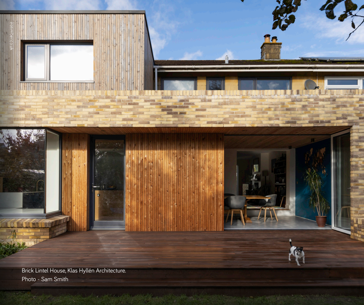
Brick Lintel House, Klas Hyllén Architecture.