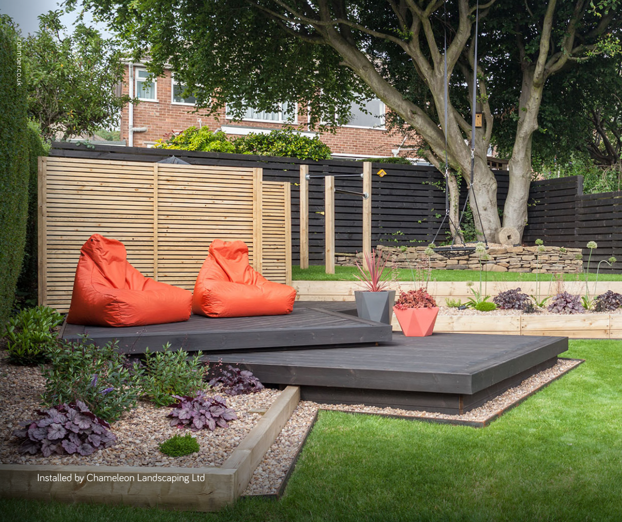
Installed by Chameleon Landscaping Ltd

"I'm really happy I won the competition and thank you for the vouchers"